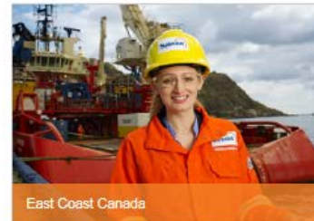
East Coast Canada