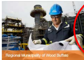
Regional Municipality of Wood Buffalo