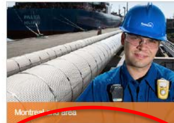
Montreal and area