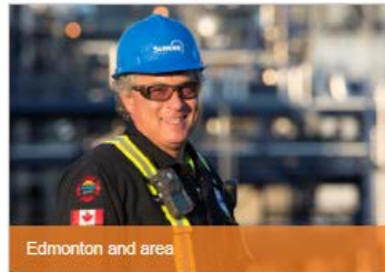
Edmonton and area